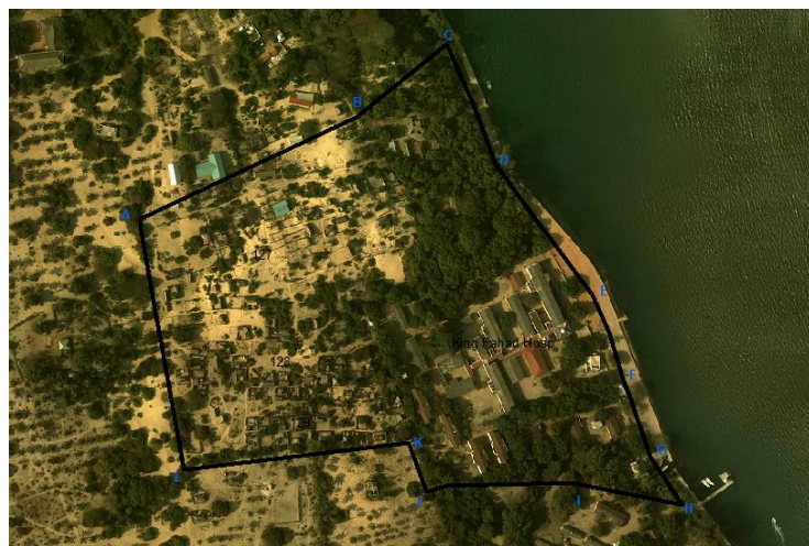
Figure 1: Location of Hidabu Informal Settlement

Existing developments in the area include King Fahad Hospital, Public Works office, Proposed Governors residence and residential developments. Formalization of the existing public utilities, structures and plots will enhance the security of tenure and further provide the necessary spatial framework for enforcement of development control.