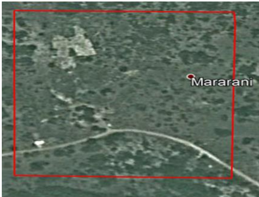
Figure 1: Location of mararani

The planning area measures approximately 75acrs, 50acrs and 50acrs for the mararani, mangai and milimani respectively.