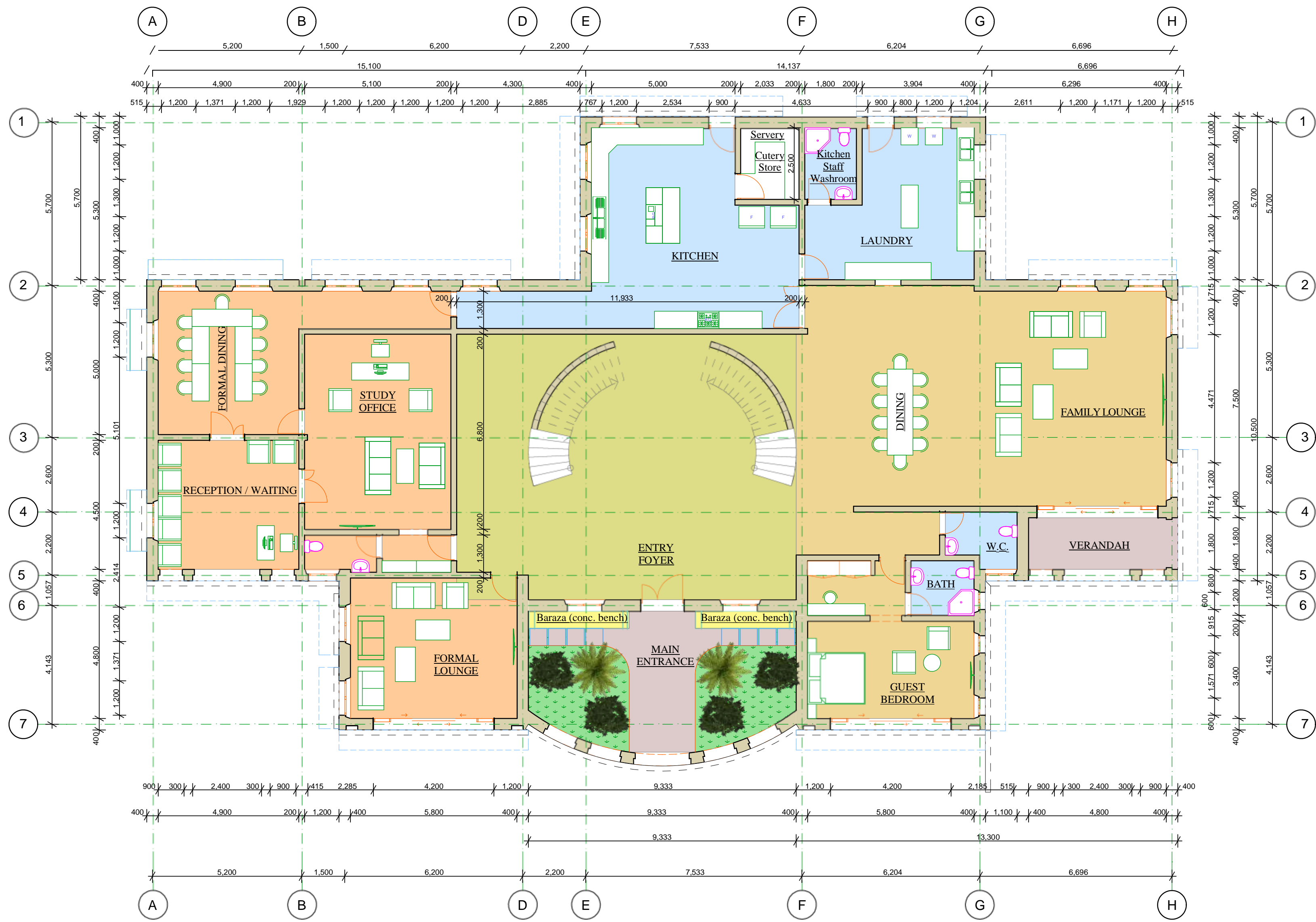
PROPOSED GROUND FLOOR PLAN LAYOUT