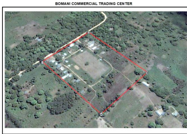
Figure 1: Location of Bomani trading centre

off Kibaoni - Mpeketoni road .The plot was designated as a trading centre in the Lake Kenyatta 1 settlement scheme. Preparation of an Advisory plan and regularization of the developments to enhance the security of tenure is important to guide the growth and development of the area. The planning area measures approximately 5 hectares .