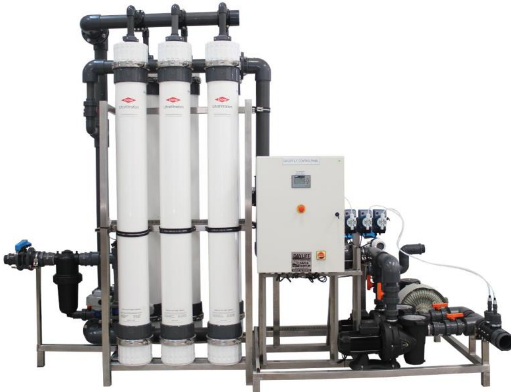
Figure 1: Ultrafiltration System